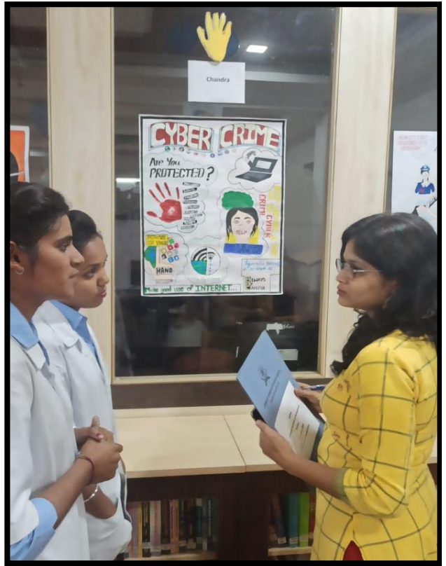
Poster Presentation by participates