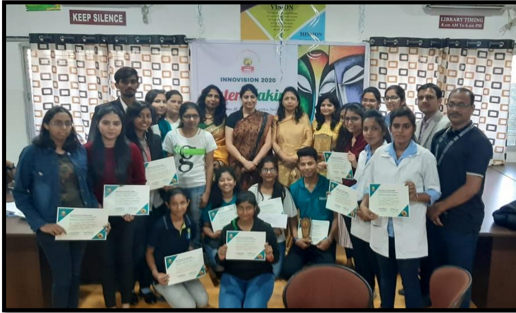
All the participants, Winner, Runner Up and Chief guest and Faculty Members