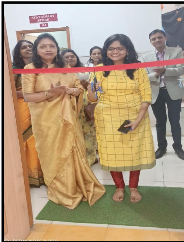
Inauguration of Event