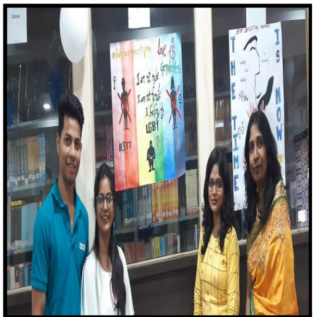
Participants preparing the posters