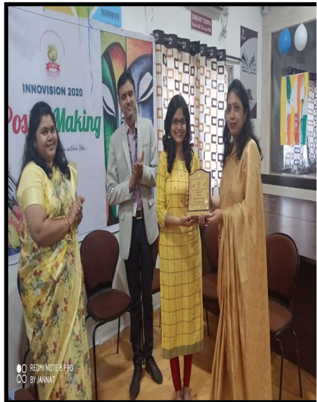
Chief Guest Felicitation